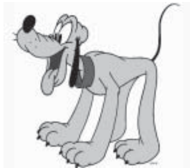
Pluto, as seen by the Hubble Space Telescope (left) or drawn by Walt Disney (right).