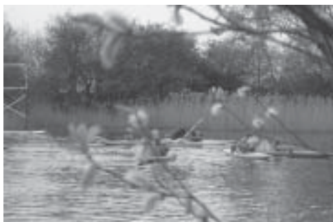
Activities at the Mepal Outdoor Centre