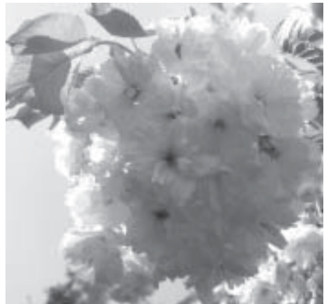
Solution to Sudoku Challenge: Coton 22 (CCN April/May page 12)